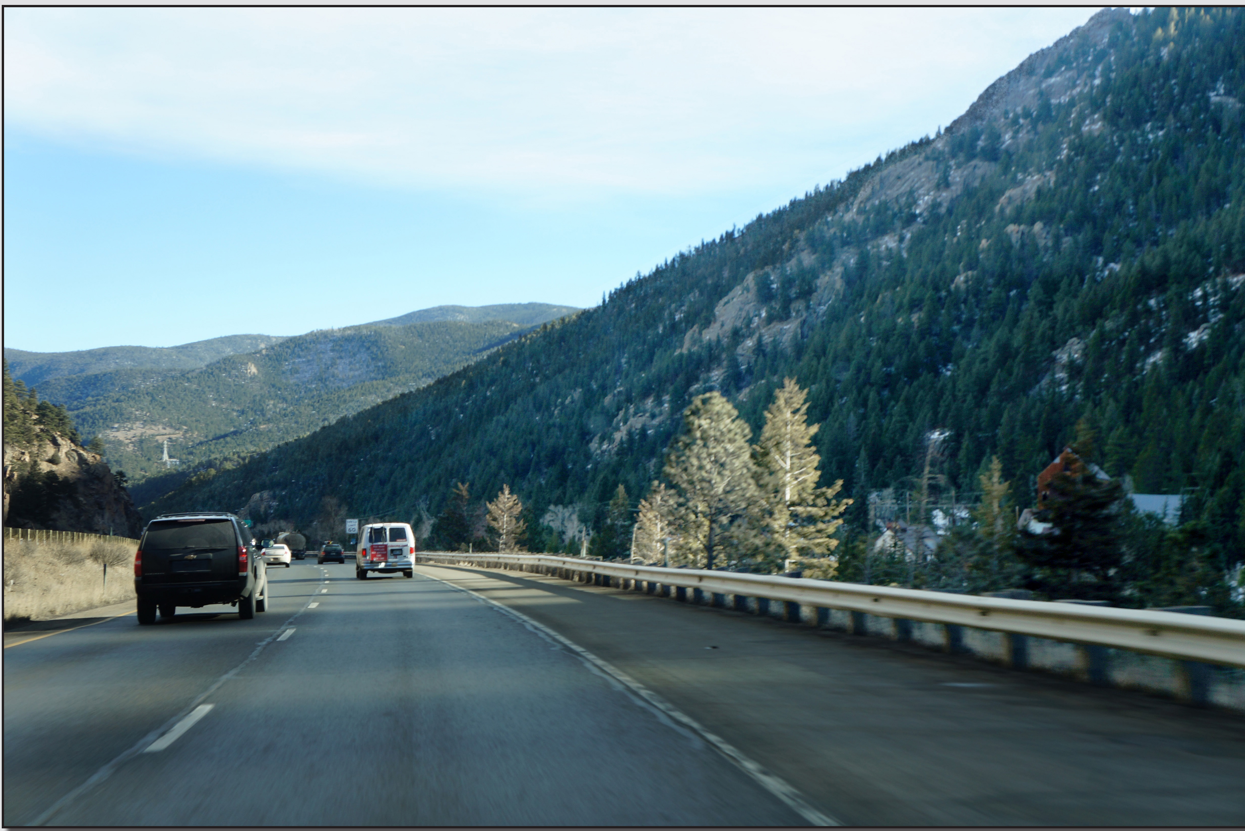
EXISTING VIEW: EASTBOUND (WEST OF IDAHO SPRINGS)

The Peak Period Shoulder Lane project will utilize the median (left) shoulder as an additional lane during peak periods. It will only be in operation during peak periods (Saturdays, Sundays, and holidays) and will be tolled.