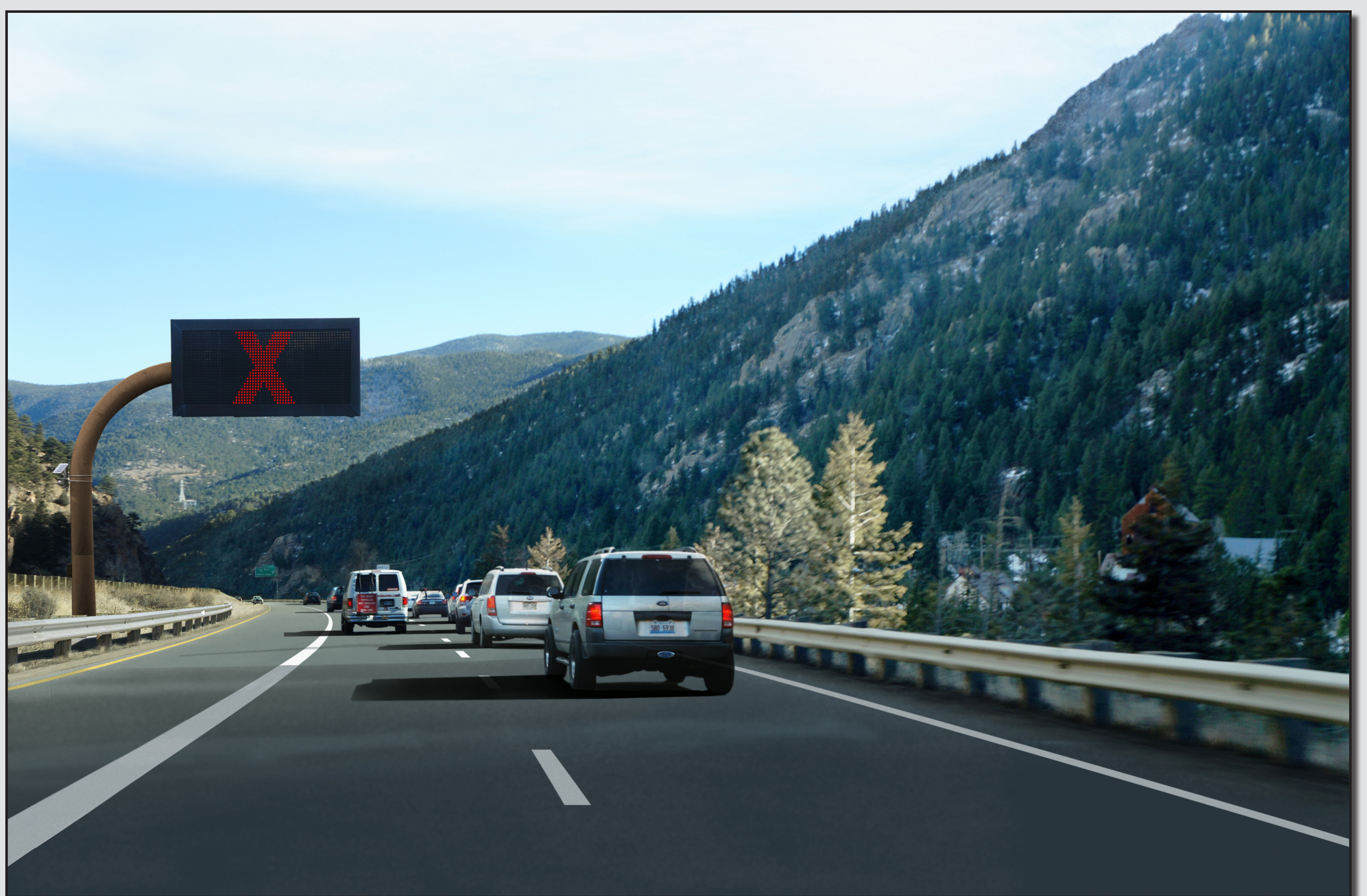
PROPOSED VIEW: EASTBOUND (WEST OF IDAHO SPRINGS)